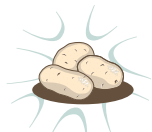
'THOSE POTATOES' Hash browns with onions, bell peppers and parsley.