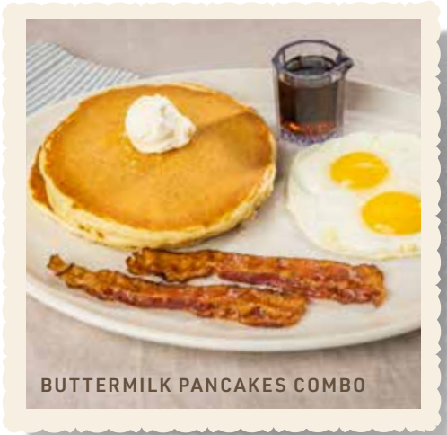
BUTTERMILK PANCAKES COMBO

ALL GRIDDLE COMBOS ARE SERVED WITH TWO EGGS ANY STYLE AND YOUR CHOICE OF BACON, SAUSAGE PATTIES OR LINKS, AND HOT SYRUP AND WHIPPED BUTTER.