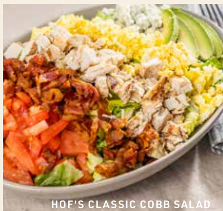
HOF'S CLASSIC COBB SALAD

Chicken breast, bacon, hard-boiled egg, blue cheese, tomatoes and avocado with your favorite dressing. 16.99