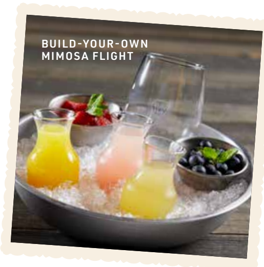
BUILD-YOUR-OWN MIMOSA FLIGHT

Bisol 'Jeio' DOC Prosecco with choice of three of the following juices: orange, cranberry, pineapple, grapefruit, guava, pomegranate. 15.00 Make it a tray with a full bottle of bubbly and three juices for $38.