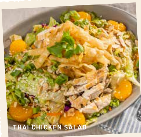
THAI CHICKEN SALAD

Chicken breast, greens, celery, red cabbage, carrots, onions, sesame seeds, almonds, mandarin oranges, wontons and spicy Thai peanut dressing. 16.99