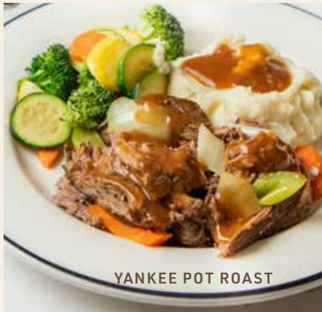
YANKEE POT ROAST