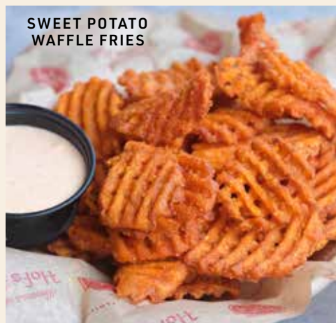
SWEET POTATO WAFFLE FRIES