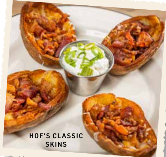
HOF'S CLASSIC SKINS