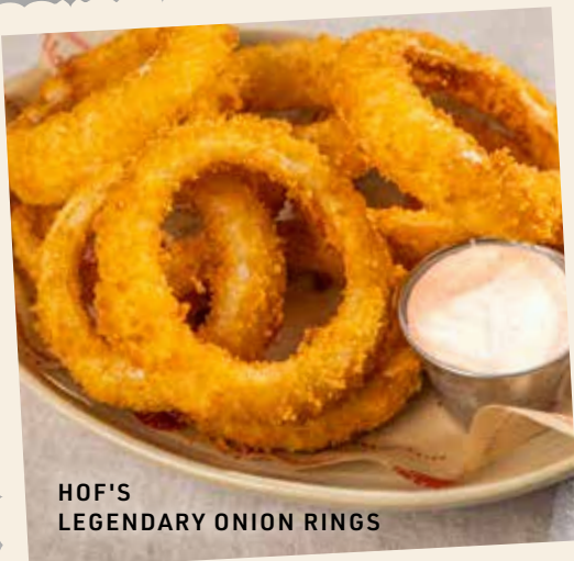
HOF'S LEGENDARY ONION RINGS

Lightly fried in our house beer batter and topped with parmesan cheese. Served with a creamy herb dip. 9.50