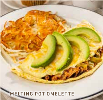
MELTING POT OMELETTE