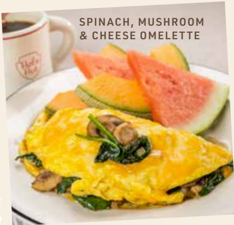
SPINACH, MUSHROOM & CHEESE OMELETTE

Sausage, bell peppers, mushrooms, green chiles, onions, and jack and cheddar cheese. 15.75