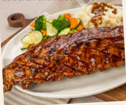
BBQ BABY BACK RIBS

OUR STEAKS ARE GRILLED TO ORDER AND FINISHED WITH SEASONED GARLIC BUTTER AND A LEGENDARY ONION RING.