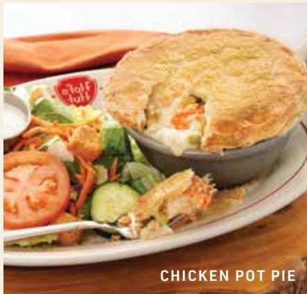
CHICKEN POT PIE

Cod fillets dipped in beer batter and lightly fried. Served with French fries, coleslaw, tartar sauce and malt vinegar. 19.99