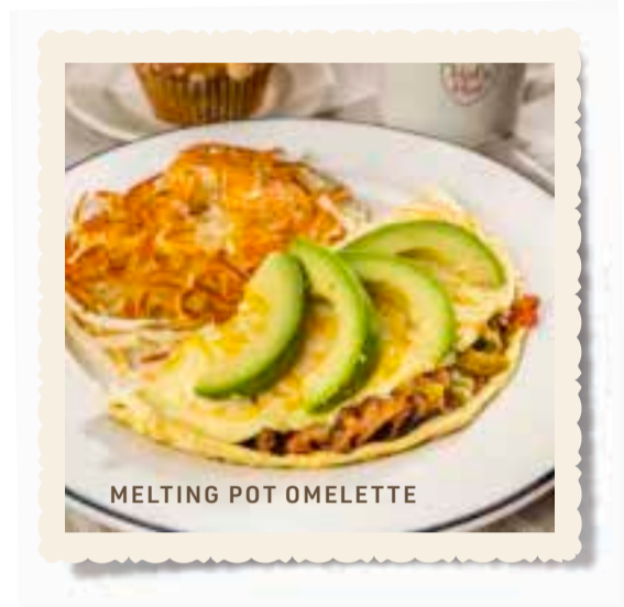
MELTING POT OMELETTE

Sausage, bell peppers, mushrooms, green chiles, onions, and jack and cheddar cheese. 13.99