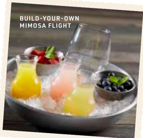
BUILD-YOUR-OWN MIMOSA FLIGHT

Make it a tray with a full bottle of bubbly and 3 juices for $36.