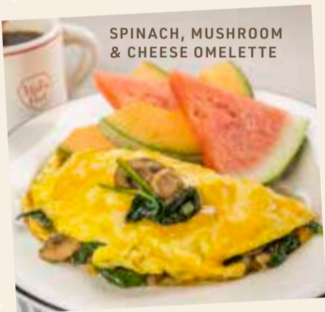
SPINACH, MUSHROOM & CHEESE OMELETTE

Chicken breast, tomatoes, onions, bell peppers, ranchero sauce, jack and cheddar cheese, and avocado. 14.99