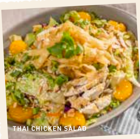
THAI CHICKEN SALAD

Chicken breast, greens, celery, red cabbage, carrots, onions, sesame seeds, almonds, mandarin oranges, wontons and spicy Thai peanut dressing. 15.99