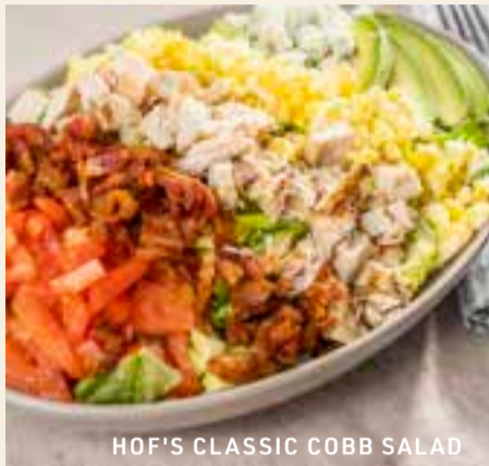
HOF'S CLASSIC COBB SALAD

Chicken breast, bacon, hard-boiled egg, blue cheese, tomatoes and avocado with your favorite dressing. 15.50