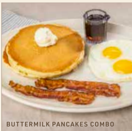
BUTTERMILK PANCAKES COMBO

ALL GRIDDLE COMBOS ARE SERVED WITH TWO EGGS ANY STYLE AND YOUR CHOICE OF BACON, SAUSAGE PATTIES OR LINKS, AND HOT SYRUP AND WHIPPED BUTTER.