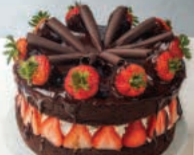
CHOCOLATE STRAWBERRY TRIFLE CAKE