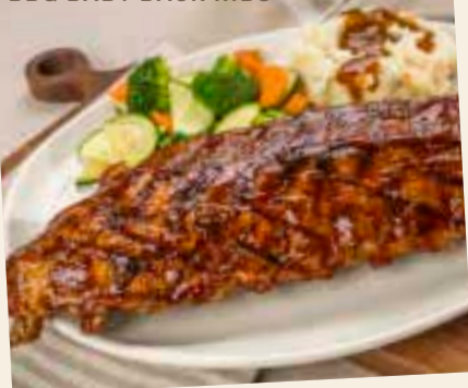
BBQ BABY BACK RIBS