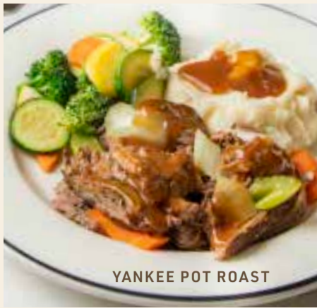
YANKEE POT ROAST