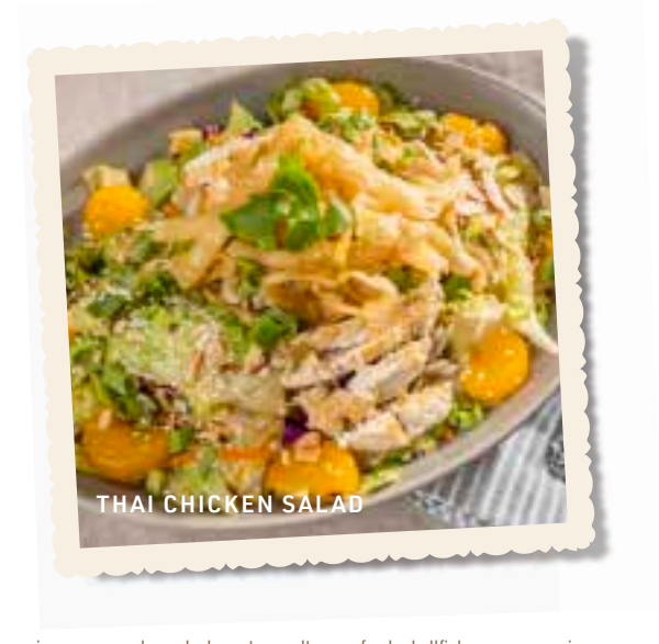
*Consuming raw or undercooked meats, poultry, seafood, shellfish or eggs may increase your risk of foodborne illness. For more information, go to www.P65Warnings.ca.gov/food. Prices subject to change. Items may vary by location.

Chicken breast, greens, celery, red cabbage, carrots, onions, sesame seeds, almonds, mandarin oranges, wontons and spicy Thai peanut dressing. 15.99