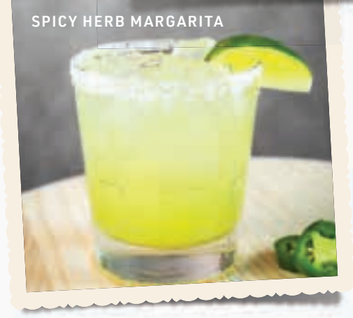
*Warning: Drinking distilled spirits, beer, coolers, wine and other alcoholic beverages may increase cancer risk, and, during pregnancy, can cause birth defects. For more information go to www.P65Warnings.ca.gov/alcohol.